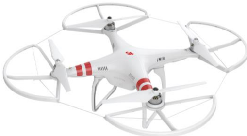
Fig.3 Complete/图 3 正确安装示意图